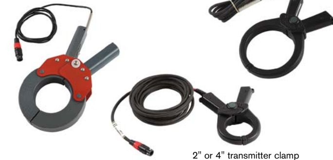
2" or 4" transmitter clamp